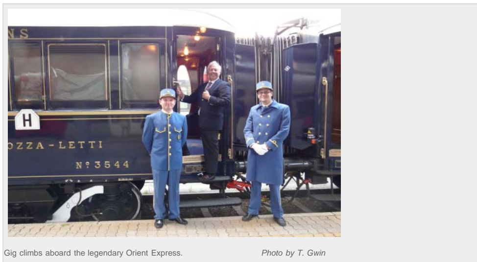
Gig climbs aboard the legendary Orient Express.