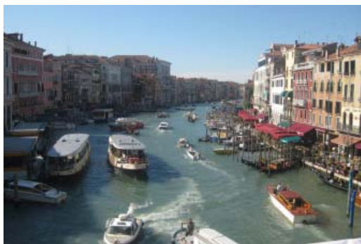
The Grand Canal in Venice.