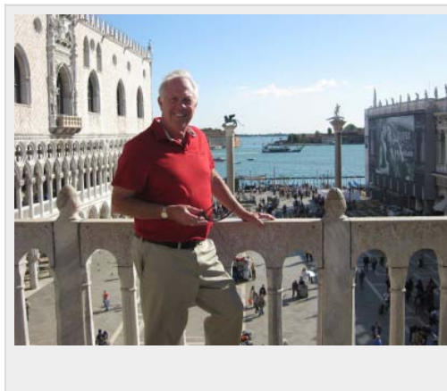
Gig admiring one of Venice's great views.

Comment Print Email RSS Subscribe Previous Next