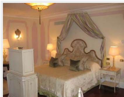
The hotel suite at the Cipriani.

What better place than Venice to embark on a romantic excursion on the Orient Express.